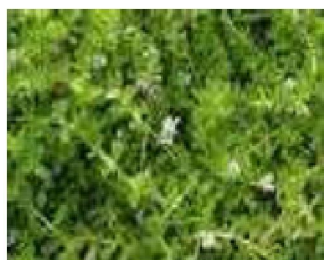
The whole plant