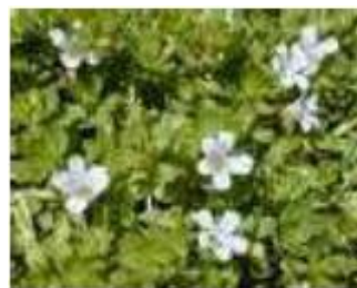
Flowers and leaves