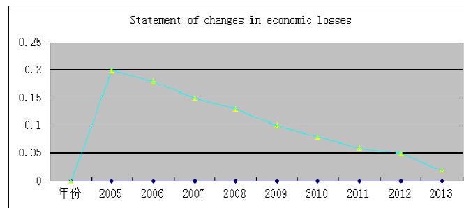
Figure 1 : The economic loss is decreasing year by year, which means the quality of electric power is getting better.

With the continuous development of economy and the overall progress of science and technology, productivity is also in constant increase. The power grid transmission of power quality problem has got more and more attention from people. Relevant data show that in the United States, due to the power quality problems, the loss has reached hundreds of billions of dollars a year. In addition, users' participation degree of electric power market is more and more deep, which leads to the closer connection between the power supply the user. So how to improve the utilization ratio of energy is what we should all be concerned. Using the advanced power electronics technology and equipment will be beneficial to solve the problem of power grid transmission quality. Apart from this, the use of power electronics technology can improve the distribution efficiency of the power grid, the realization of the maximum for users with high quality, and the electricity supply for colleges and universities. The chart below shows the specific situation (see Figure 1):