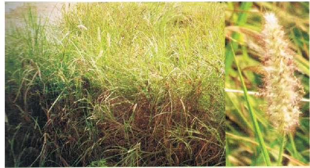
■ Cenchrus ciliaris L. (Poaceae) Dhamaniyu ghas