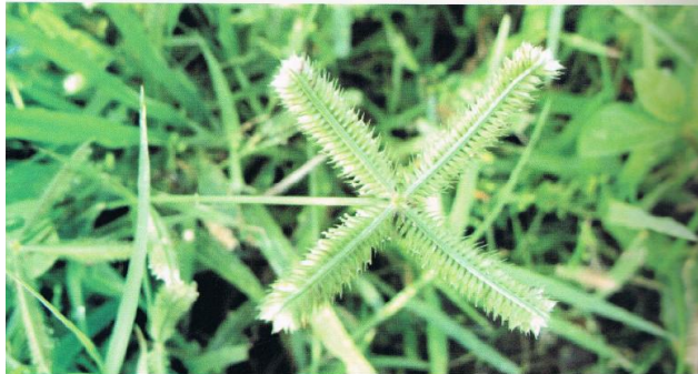
♥ Dactyloctenium aegyptium (L.) Beauv. (Poaceae) Mak