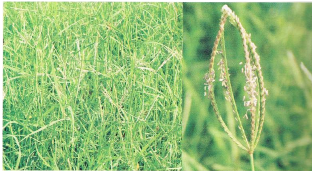
■ Cynodon dactylon (L.) Pers. (Poaceae) Darabh