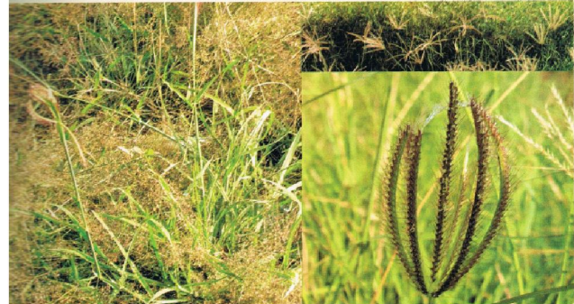
♥ Chloris barbata Sw. (Poaceae) Shiyal punch