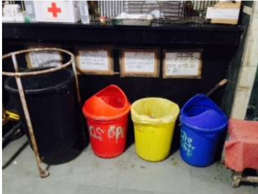
FIG. 1. Colour coded bins and labelled cardboard boxes installed in casualty ward of hospital for collection of different types of bio-medical waste.

Through all the departments except the administration and the public area, the different colour codes are used for the segregation of waste before transportation for final disposal. In the public area, there are metallic and plastic bins used for general wastes, even though sometimes things like diapers etc., are dropped in by patients after changing their babies. The colour coding practice is being followed by most departments at the hospital but few individuals are still found to be neglecting the use of colour codes (FIG. 1).