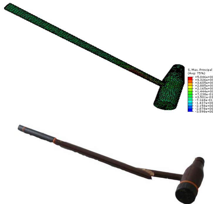
Figure 2 : The maximal stress distribution of mallet (top) and fracture mallet in real performing event (bottom).

As shown in Figure 2, the maximal stress was concentrated in the proximal of the bottle, which was in good accordance with the mallet fracture happened in real performing event. It is very important to add some special design or material process for strength reinforcement on the proximal of the bottle.