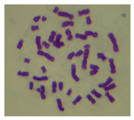
Figure 7: Chromosomal study case 1

In this report one of the patients (case 3) have absence of his left hand & radius (left Acheiria & radial hemimelia)<sup>[8]</sup>. Radial hemimelia is a congenital longitudinal deficiency of the radius bone of the forearm characterized by partial or total absence of the radius. It occurs in 1/30,000-100,000 live births, and is slightly more common in males than in females (sex ratio of