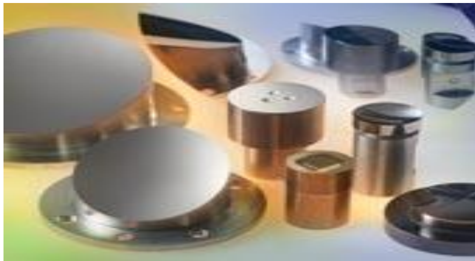
FIG. 1. Metal based high quality optics.

Investigating many metals and alloys of possible use for mass production, it was demonstrated that one could increase the threshold of optical serviceability of these new mirrors by ten times as compared to a traditional quartz element.