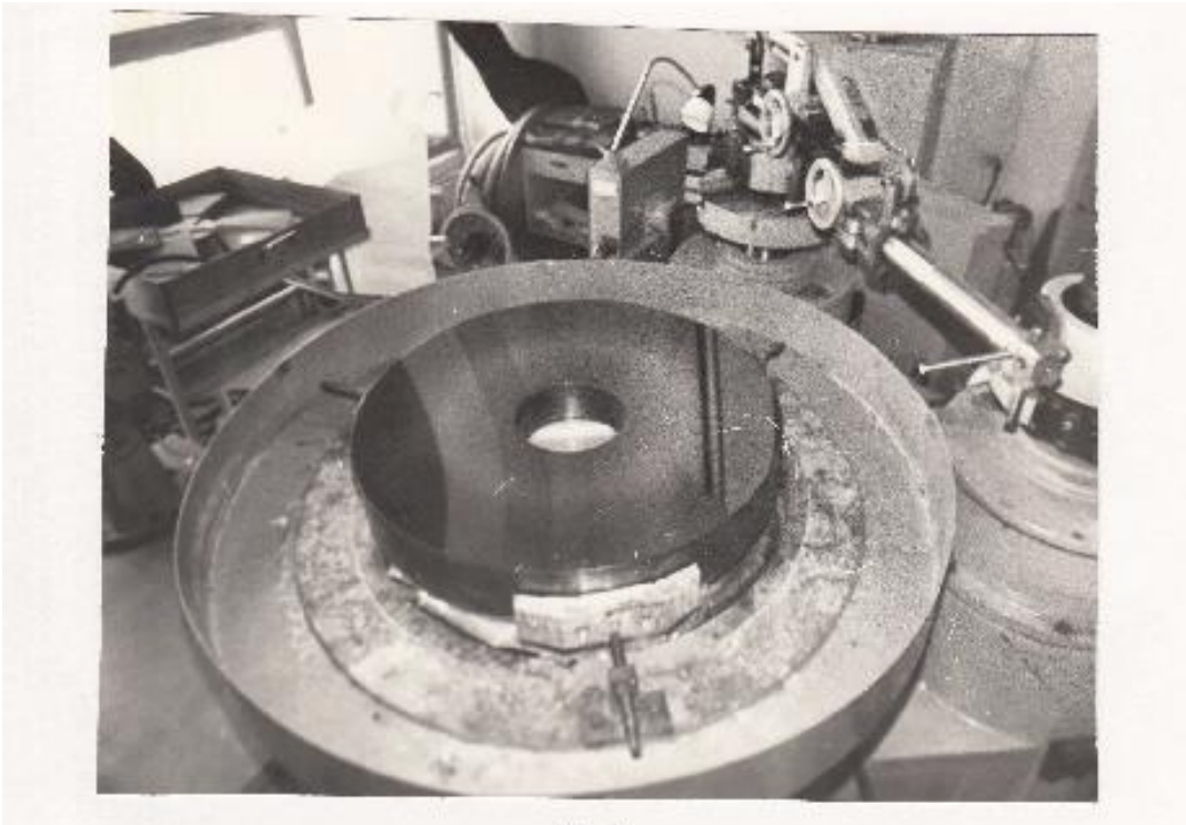
FIG. 4. Big size SiC mirror under polishing.