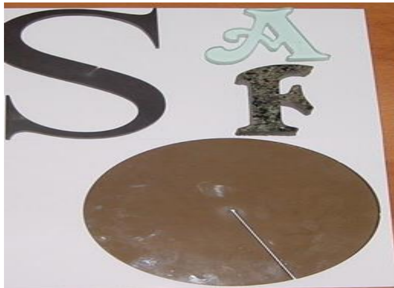
FIG. 3. Laser cut examples of technology (glass, composite, stone, sitall).

There are still possibilities to further improve these “power/energy optics.” By changing the pressure of the coolant it is possible to force it to boil at room temperature. This is within the conditions similar to those of the final treatment of the mirror’s surface. During the boiling of the coolant, part of the absorbed heat is used for steam formation, thus heat removal efficiency is tens to hundreds of times higher than within convective heat transfer. Steam can easily penetrate into porous capillary substrate structure.