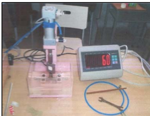
Fig. 1: Fatigue corrosion machine