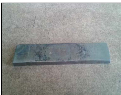
Fig. 2: Fatigue corrosion sample