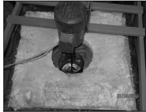
Fig. 3: Furnace set-up with stirrer