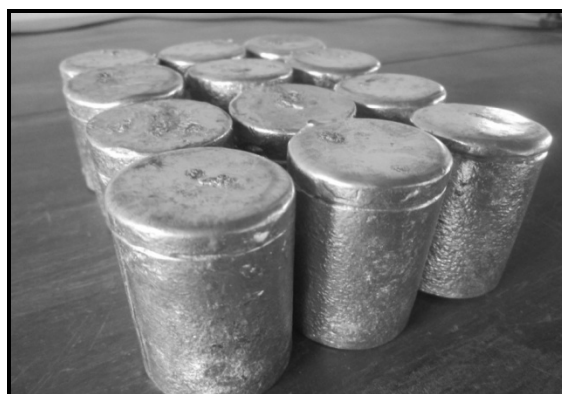
Fig. 1: Tin alloy (Matrix phase)

tin content in Babbitt is used in high speed and low pressure applications because of its light weight and hardness properties.