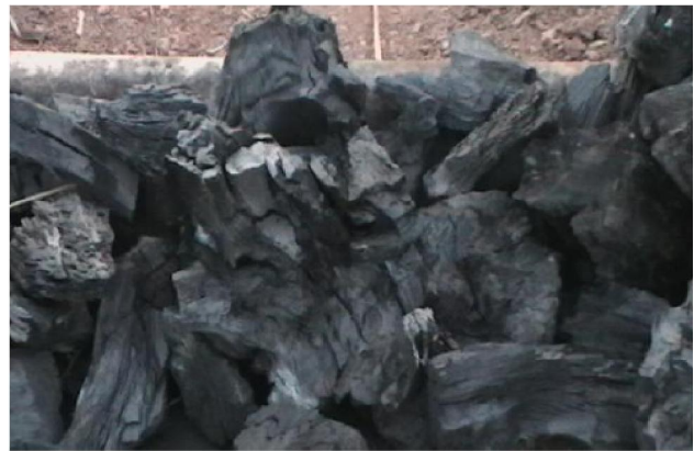
Plate 4 : Samples of collected fragmented charcoal

The figure shows that W_{GA} has the lowest burning duration (8days) with highest charcoal yield (22kg) followed by D_{GA} (12days) with 4kg yield while D_G being the highest (13days) with lowest charcoal yields (0.13).