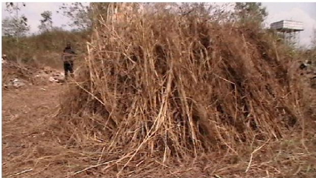
Plate 3 : Samples of a packaged charcoal