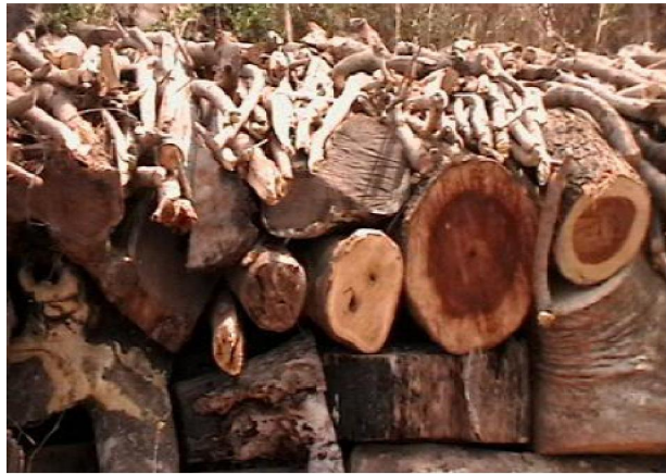
Plate 1 : Arranged billets of wood