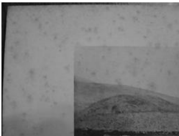
Figure 1 : Foxing spots in a photograph from HMLP

Samples were taken from the surfaces of photographic paper with fox-like reddish-brown colour spots, type “foxing” (Figure 1) in the Historical Archive of the Museum of La Plata (HMLP), Argentina, with sterile cotton swabs. They were homogenized in 10 ml of sterile saline and inoculated on Plate Count Agar (PCA media) for to grow heterotrophic mesophilic bacteria [17,19,26] . Bacteria were typified according to the Gram stain and biochemical tests [36] . Bacillus spp. were identified by molecular techniques (16S rRNA gene), with NCBI accession number EU184084 = Bacillus sp. and NCBI accession number AM747224 = Bacillus thuringiensis [19,20] .