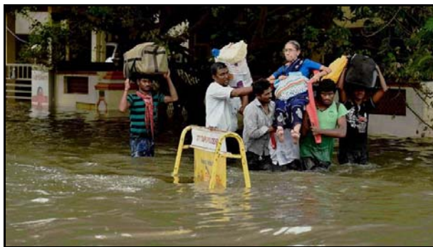
Fig. 3: Chennai under flood

The recent flood in Chennai has experienced many hardships related to miscommunications between several agencies involved in the relief operations, Many voluntary organisations and several other independent groups have involved themselves in the relief works without following the ethical and professional norms. This has resulted in great difficulty difficult for the government agency to coordinate with them. Every smaller voluntary agents stated distributing the food pockets, without proper communication with government agencies, which in turn has resulted in a lot of resistance and confusion. It is right time for our people to have proper live saving implements at village level to meet out the emergencies in the event of a disaster.