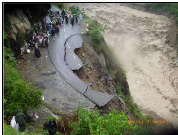
Fig. 2: Uttarkhand landslides and floods

Uttarkhand landslides subsequent floods had given as bitter lessons to be learnt. There was no communication to the affected area and the government agencies could reach the disaster site only after many hours. The places were on hilly terrain and were extremely difficult for the relief teams to reach those places. Many constructions are seen built in an unsafe manner without following the development control rules of the local land building development authority.