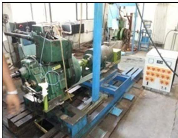
Fig. 1: Experimental setup

The engine used in this work was a four stroke single cylinder diesel engine of Kirloskar make. The eddy current dynamometer was coupled to the engine for loading. The set-up was provided with necessary instruments for measuring combustion pressure and crank angle. Various sensors are connected to the setup and they are interfaced to a computer. The experimental setup is shown in Fig. 1 and the specifications of the engine are shown in Table 1.