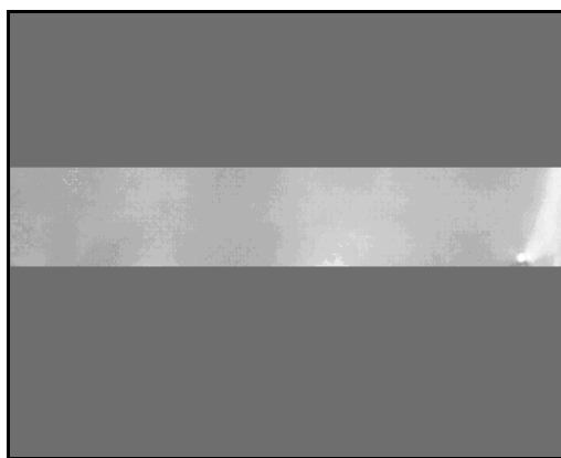
Fig. 1: Foil smooth (50 microns)

Catalysts creation on base of the metal blocks was carried out by the developed in the laboratory methods 9 . For preparation of the block carrier the heat resisting foil by thickness 50 microns of settlement length and width was cut (Fig. 1). Then a foil was subjected to corrugating, on a smooth foil the corrugated tape then were winded to the cylindrical block (Fig. 2).