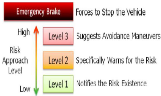
Figure7 : Cycling Wheelchair Brake system [7]

different type of methods for instance, using computational control system. Technical features are obviously considered to be a significant part for all system and there is no disagreement about the importance of it. On the other hand, for the wheelchair technology the interaction and compatibility of the human body to the wheelchair system has an inarguable importance for feeling comfortable when in use [14] . This is mainly due to the anthropometric structure of human body. Due to the considerable differences within disabilities, anthropometric data is needed to achieve maximum usefulness and to design a convenient wheelchair for all disabled people [8] . In this context, Paquat and Feathers (2004) also mentioned that there are anthropometric differences mainly from gender, wheelchair type and age