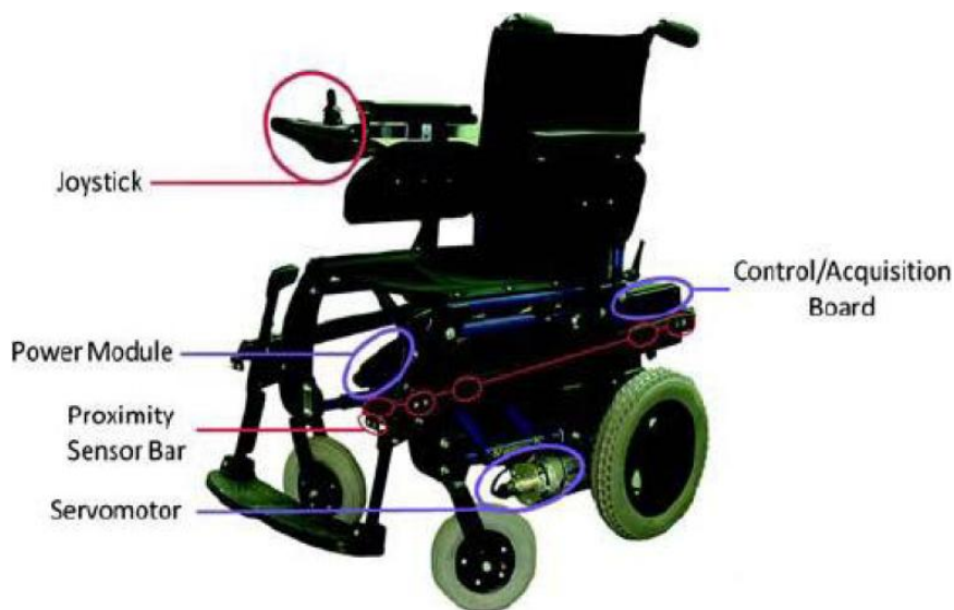
Figure 5 : Smart wheelchair prototype