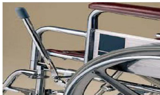
Figure 2 : Brake system of a smart wheelchair

As mentioned above, these tools can be considered main technical features for mainly all types of wheelchairs, apart from this smart wheelchair technology includes some electronic materials which