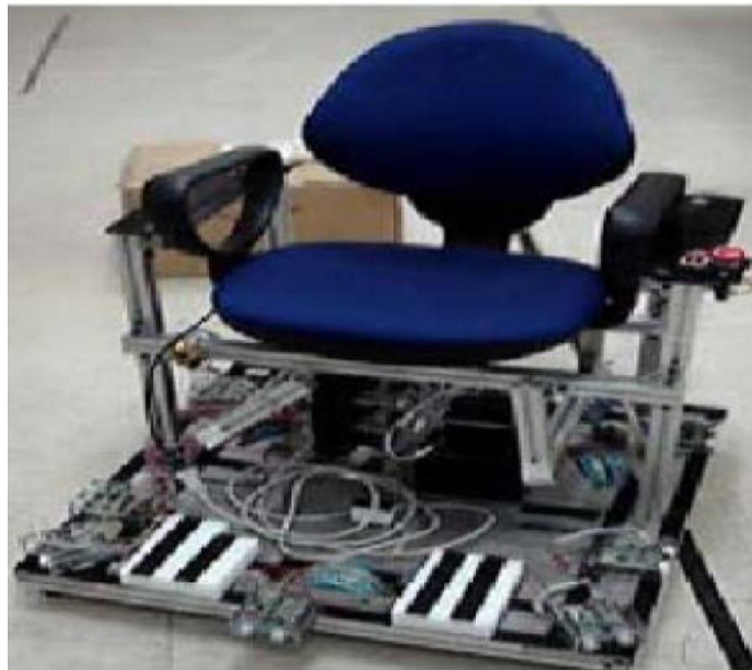
Figure 8 : Embedded control system [9]

There is a significant increase in the number and types of wheelchair with very high quality and more functionality. Having an advance in technology allows designer and engineer to design better wheelchairs as well as any kinds of machine to provide easy use and make life easy for people. Controlling a device by a driver is the first main step to have safe travel in any kinds of machine. For disabled people, controlling has a vital importance thereby it is tried to use computer based control system in the wheelchair system (smart or intelligent wheelchair). For example, Autonomous robotic wheelchair, which is a kind of smart wheelchair, technology uses an embedded control system [9] . In this system some kinds of information are collected from the environment by sensor or other electronic tools and evaluated in computer based control sys-