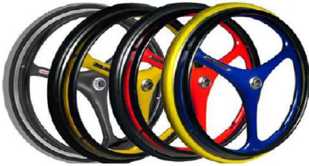
Figure 3 : Wheel design of a smart wheelchair

provide easy control and more penetration to life.