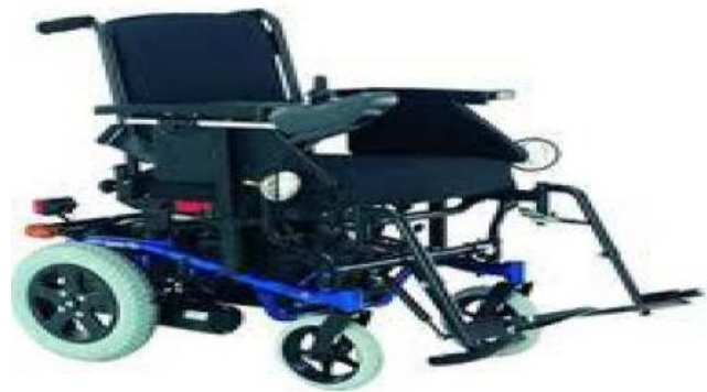
Figure 1 : Frame of a smart wheelchair

Brake requires stopping wheelchairs in all re-