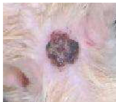
2% Extract Treated Group