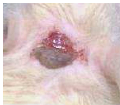
Standard Drug Treated Group