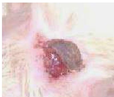
1% Extract Treated Group