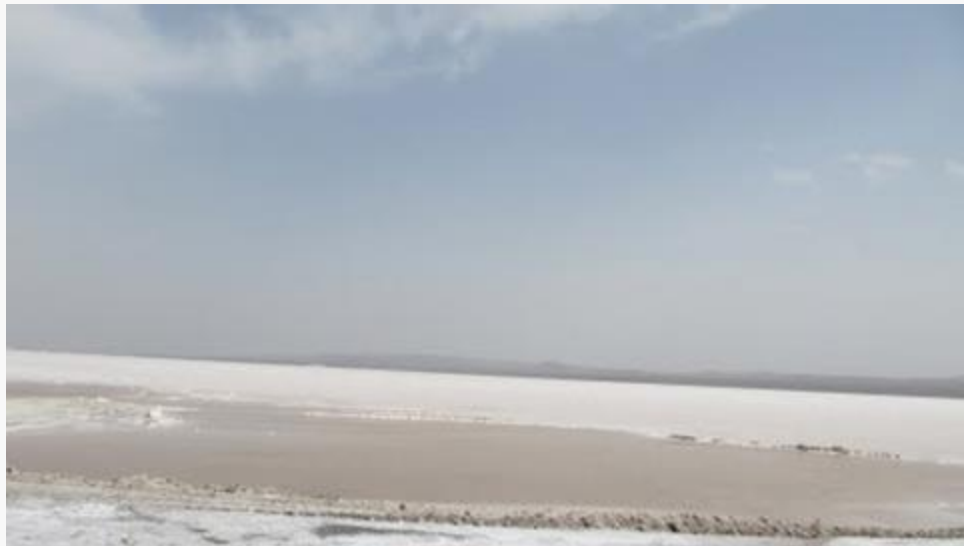
FIG. 1. Hoz-e soltan salt lake

Sampling from different parts of Qom hoz Sultan Salt Lake, including soil, water and salt was performed. Samples were collected in sterile conditions are coded and transferred to the laboratory, where they were prepared for planting (FIG 1).