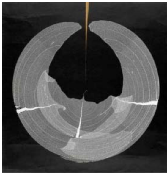
Figure 3 : Amen 11 digital engraving, poland

Therefore it can be said that the development of digital engraving brings new development direction for engraving creation. Artists through practice, are trying to make the breakthroughs in expressing techniques and materials of the traditional engravings and has made continuous explorations and trials for new materials and new technology. The TABLE 1 in below is the comparison between digital engraving and traditional engraving: