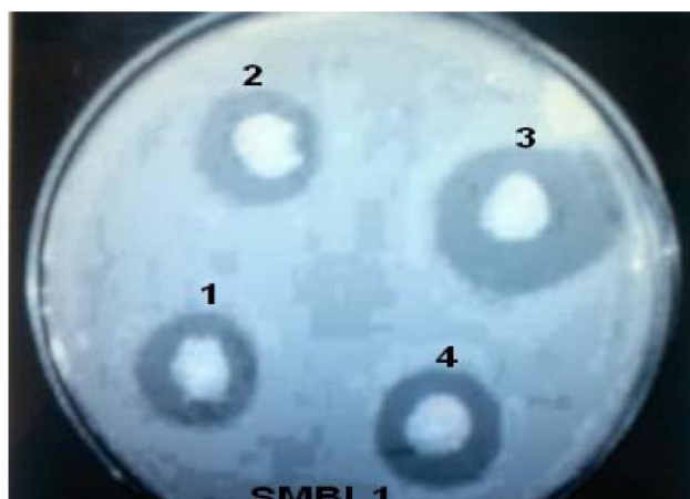
Figure 3 : Antibacterial effect vis-à -vis Staphylococcus aureus ATCC 25923 extracellular part of the SMBL1 strain after thermal treatment at 100°C by the method of diffusion on Tryptic Soy Agar medium after 24 hours of incubation at 30°C in the dark; (1) Witness ; ( 2 ) : 15 min ; ( 3 ) : 20 min ; ( 4 ) : 30 min