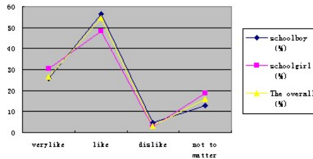
Figure 2 : Our country colleges' student football lessons

In order to more intuitional, more clearly observe colleges students football course attendance attitude, draw TABLE 2 data into broken line Figure 2 as following: