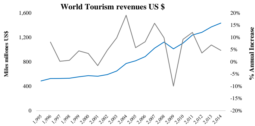
FIG. 1. International tourist’s revenues.