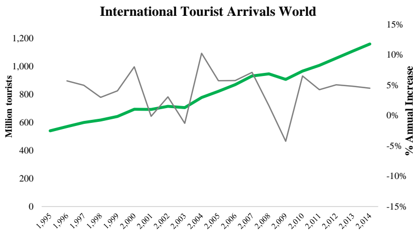
FIG. 2. International tourist’s arrivals.

Projections UNWTO presented at the general meeting of 11 October 2011, tourism estimates presented until 2030, with 1.8 billion tourists [5], almost doubling the values of 2010, with a constant rate annual growth of 3.3%, which will not be equal in all areas, with the highest growth emerging countries with 4.4% annual growth doubling in advanced economies, with 2.2% a year. Europe will remain the preferred destination of visitors, but spend from 51% to 41% of current global tourists in 2030. Traditional tourist areas (Europe and America) account for the largest number of hotel rooms with three quarters of the total, however, their growth rates are lower than those for other emerging tourist areas such as East Asia and the Pacific, which it shows a shift of tourist flows towards less traditional regions. The global hotel capacity is estimated at 16 million beds in 2000, which is estimated on the updates has increased 65% globally. In absolute terms Europe is offering the highest proportion of beds (40%), followed by the Americas (32%) [15].